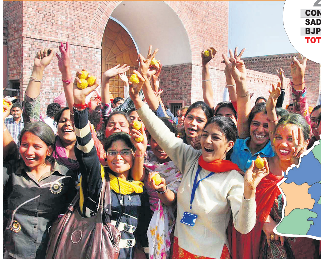
SAD supporters celebrating outside the residence of Parkash Singh Badal in Lambi village, Muksar, on Tuesday.

MAJHA 2007 CONG 03 SAD 17 BJP 07 TOTAL 27