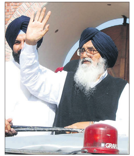
EC NO. CONSTITUENCY