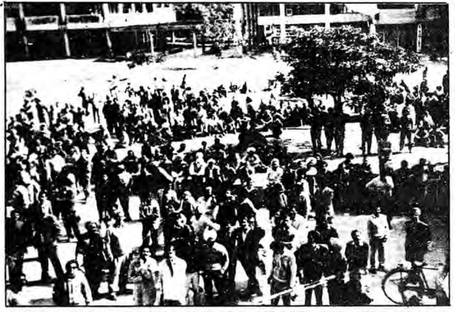
Anxious crowds eager to know the election results in Sector 17 near the Press Information Bureau office, Chandigarh, on Thursday,

Tribune News Service swept to power in Punjab, with a thumping mandate. having secured a two-thirds majority in the State Assembly, ending nearly nine years of political wilderness in the troubled