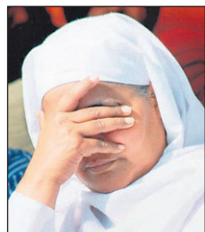
Bibi Jagir Kaur SAD (Bholath)