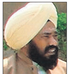
S.S. Dullu Cong (Khanna)