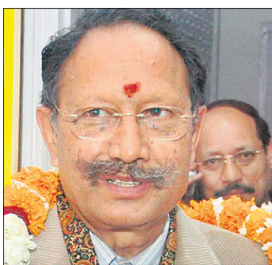
B.C. Khanduri: likely CM

The BSP won eight seats while three seats each went to the kitty of the Uttarakhand Kranti Dal (UKD) and the independents. In the 70-member Assembly, election for the Bazzpur constituency was countermanded due to the death of the Congress candidate in a road accident.